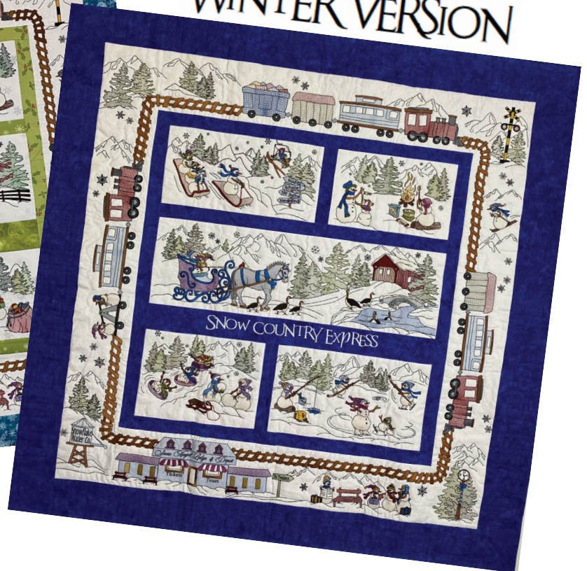
Photo above actual quilts. Snow Angel Block not shown. Changes have been made to enhance the design. Refer to Instructions for accurate pictures.

All aboard! Snow Country Express! Leaving track #29, I want to be there on time! Enjoy First Class seats on a wonderful sightseeing journey around mountainous pine and snow filled countryside!